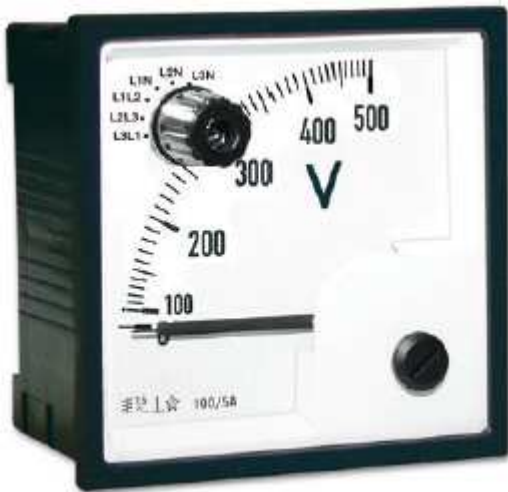
MI72SW | MI96SW

72x72 96x96 Moving iron instrument with selector switch class 1.5